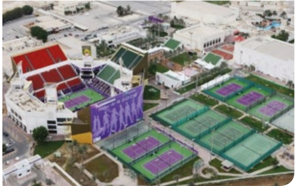
Top View of the Khalifa International Tennis and Squash Complex