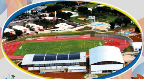
Centro de Capacitação e Aperfeiçoamento Físico CECAF