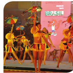
Brazil The country of sport