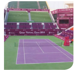
Qatar Tennis 2015